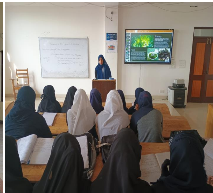
Glimpses of College